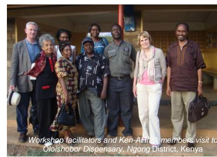
Workshop facilitators and Ken-AHILA members visit to Oloshobor Dispensary, Ngong District, Kenya

IFLA / FAIFE WORKSHOP UGANDA 11-12 AUG, 2009