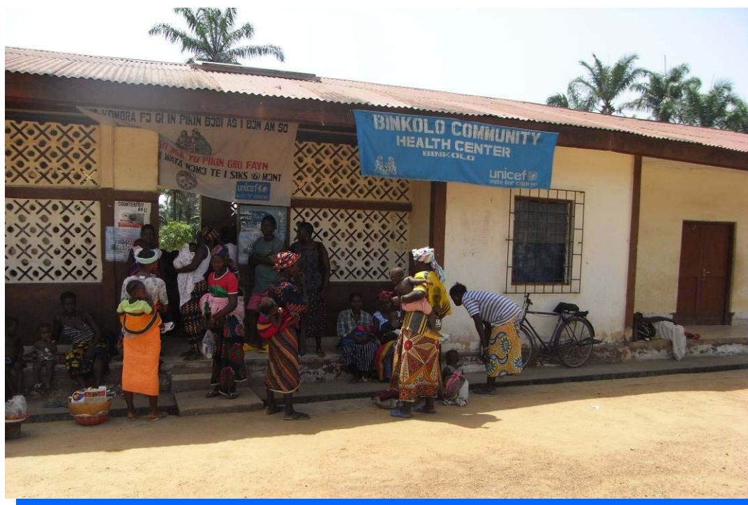
Binkolo Community Health Center, Sierra Leone